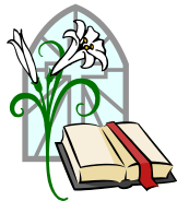
Table Talk - Friday 21st February at 12 noon in JPH.

Mothers' Union Meeting - Tuesday 18th February 2 for 2.30pm in JPH.